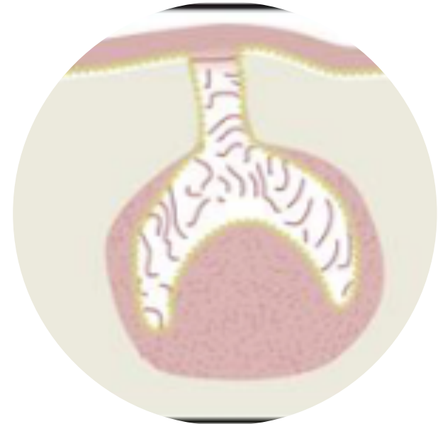
3. Cap Stage (9 th - 10 th week)