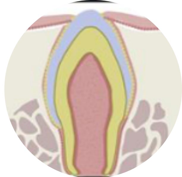
6. Maturation Stage (Varies Per Tooth)