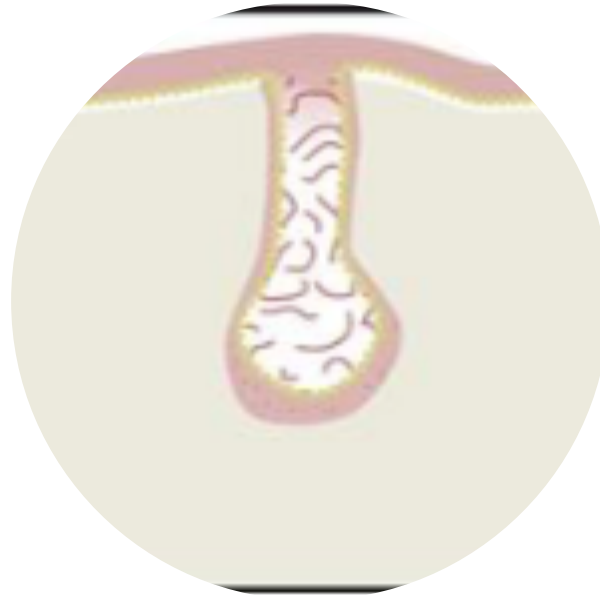
2. Bud Stage (8 th week)