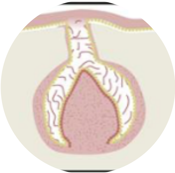
4. Bell Stage (11 th – 12 th week)